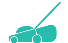
Professional Yard Maintenance