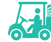
Hit the Links in Minutes*