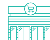
Grocery Store Nearby & Online for Delivery*