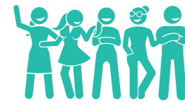
Social Programs Clubs & Events

Be Social. Meet cool people, do cool stuff.