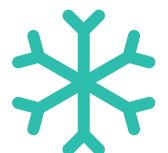
Deep Snow Removal**