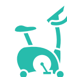
On-site Health & Fitness