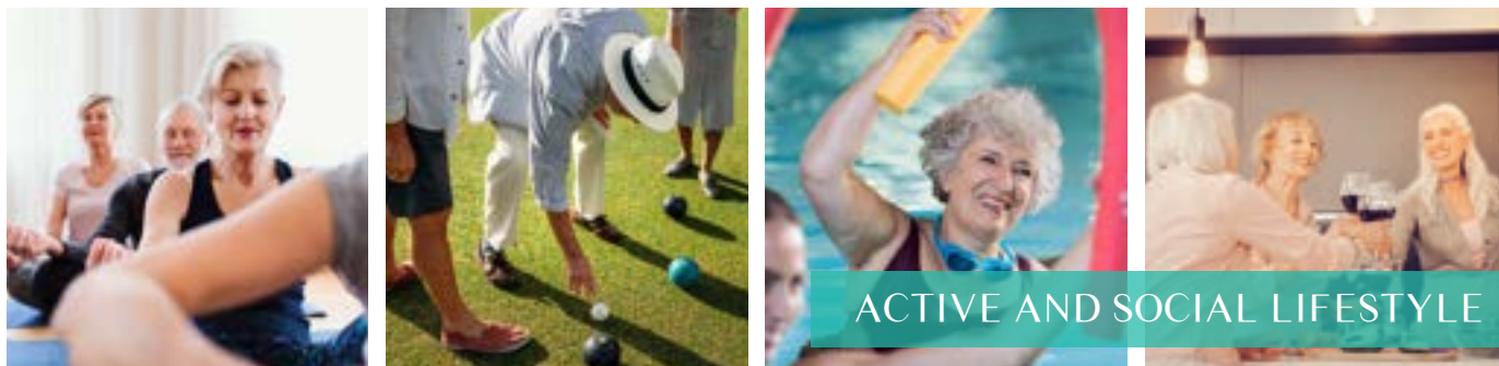
ACTIVE AND SOCIAL LIFESTYLE