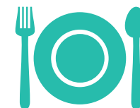
Close to Cafes & Restaurants*