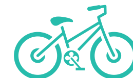
Extensive Bicycle Routes*