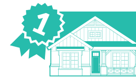
Award Winning Home Designs

The Cadence Life - live in a community curated just for YOU.