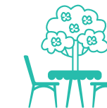
Community Dining Patio