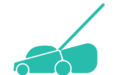
Professional Yard Maintenance