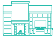
Luxurious Interior Finishes