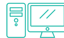
Onsite Tech Center