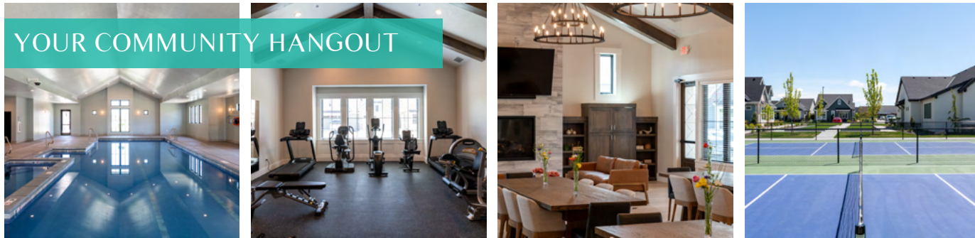
YOUR COMMUNITY HANGOUT