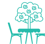
Community Dining Patio