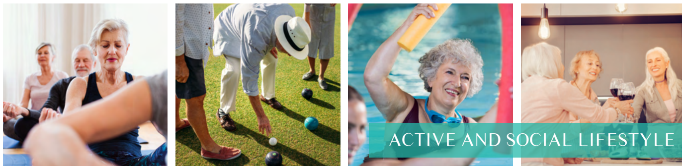
ACTIVE AND SOCIAL LIFESTYLE